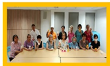
社區服事 180 乐龄活动中心