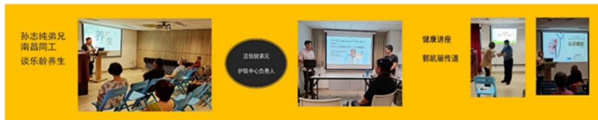
孫志純弟兄 南昌同工 談乐龄養生